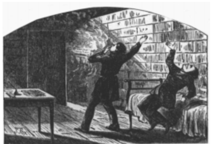
Assassination of Joseph Smith and his Brother Hyrum

of a new religion, which was to make his name known, not only in his own country, but over the world; made by "Di-